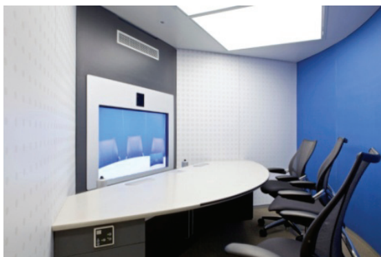
The V3 offers the perfect environmental setting for high definition video conferencing

The Vpod v3 is a unique standalone fully integrated video conferencing environment. It is designed for use with high definition video conferencing equipment ensuring clarity of picture. It provides a consistent video conferencing environment ensuring a fully immersive and clear communication experience.